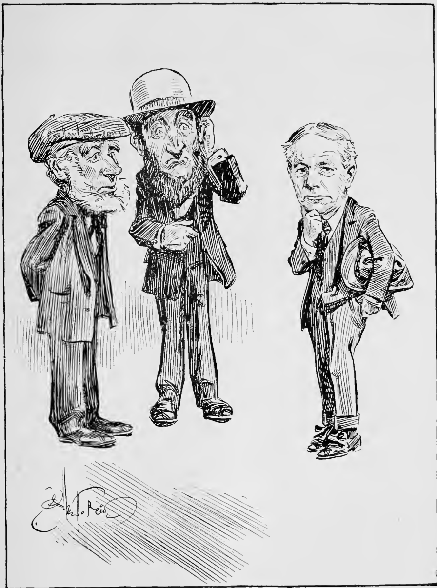
INTRODUCING A JOKE TO OUR BRITISH COUSINS